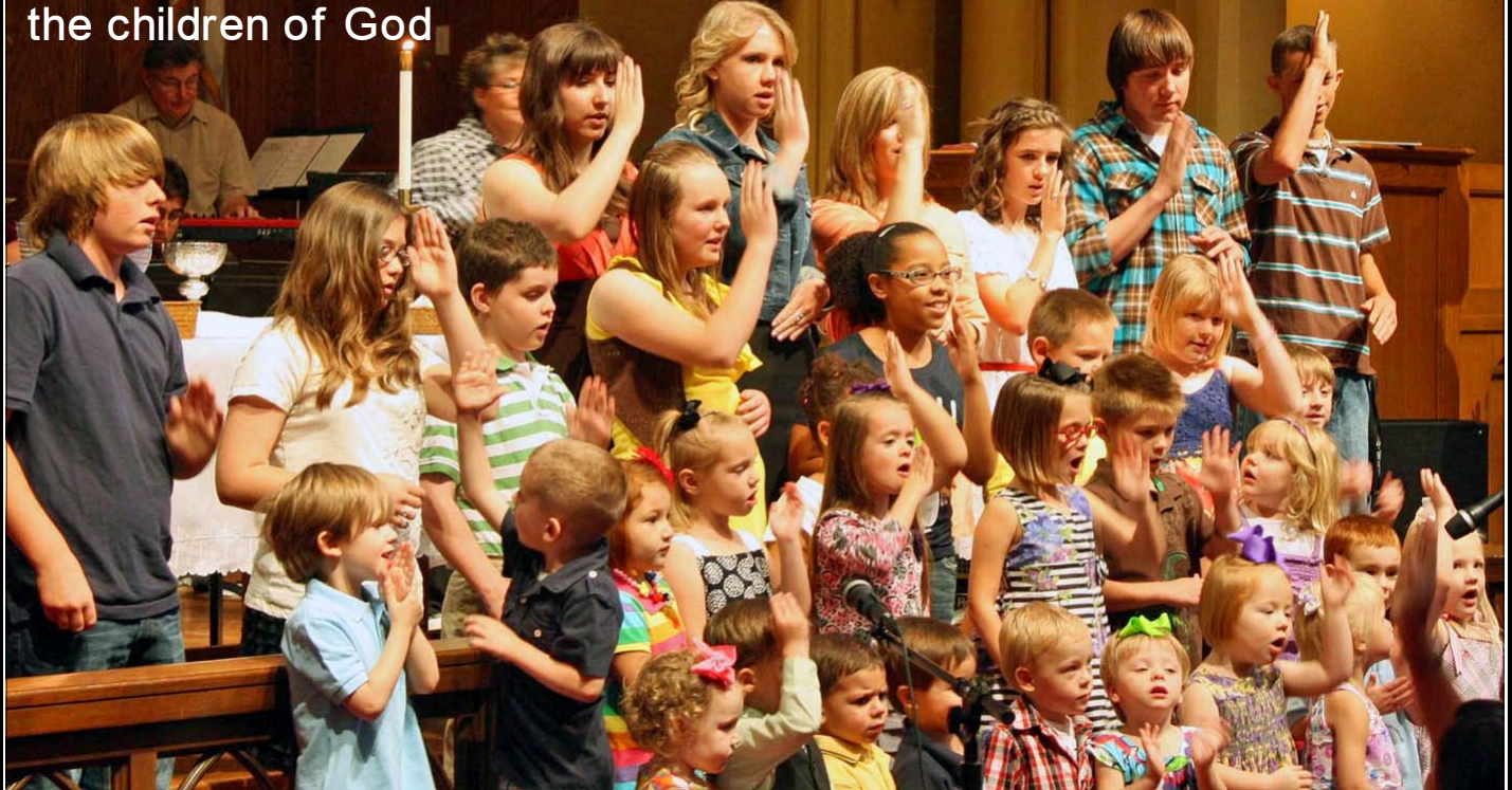
Our children of God, ages 2 years up to teens, sing a joyful Children Of God in celebration on Sunday, April 3.

Praise to the Father ... to Him we will sing ... Now we can be called the children of God