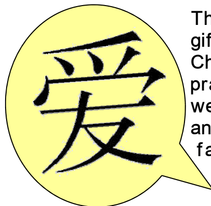
Chinese Symbol for Love