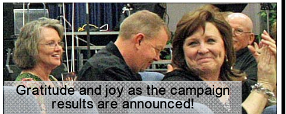
Gratitude and joy as the campaign results are announced!