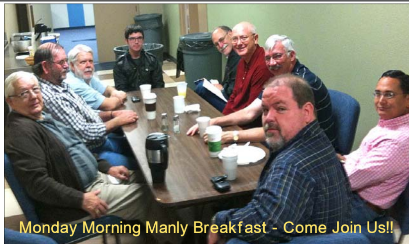
Monday Morning Manly Breakfast - Come Join Us!!