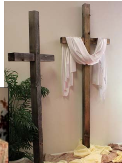
The three crosses from Maundy Thursday were placed in the narthex of the sanctuary for the triumph of Easter Sunday. A shining white cloth replaces the black cloth to depict the resurrection of Jesus Christ.