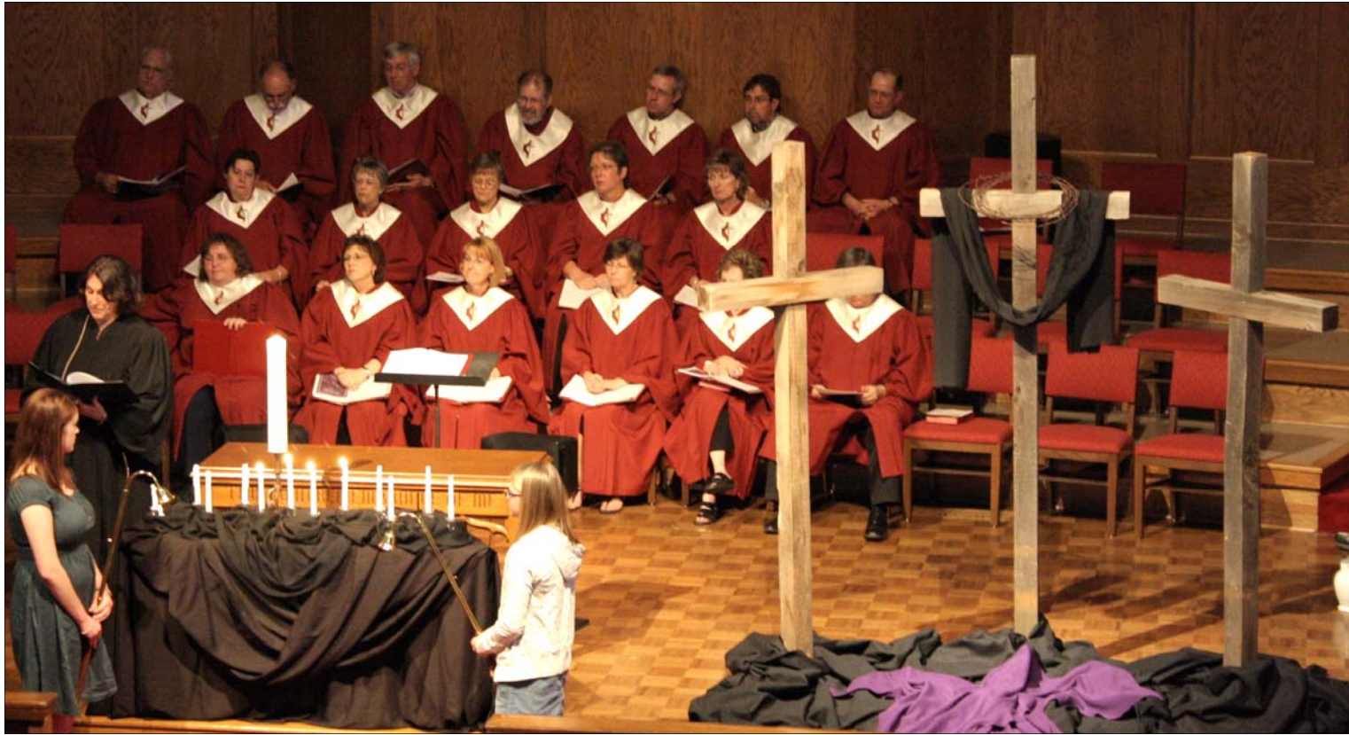
Twelve candles are extinguished during Maundy Thursday's Tenebrae service. As scriptures are read telling the story of betrayal by the disciples during Christ's last hours, a candle is snuffed, until only the lone Christ candle remains. It, too, is extinguished, depicting the death of Christ. The bare altar and three crosses evoke the darkness of the crucifixion.