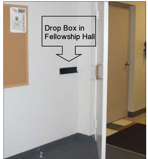
The secure drop box in the Fellowship Hall is behind the east entrance doors.