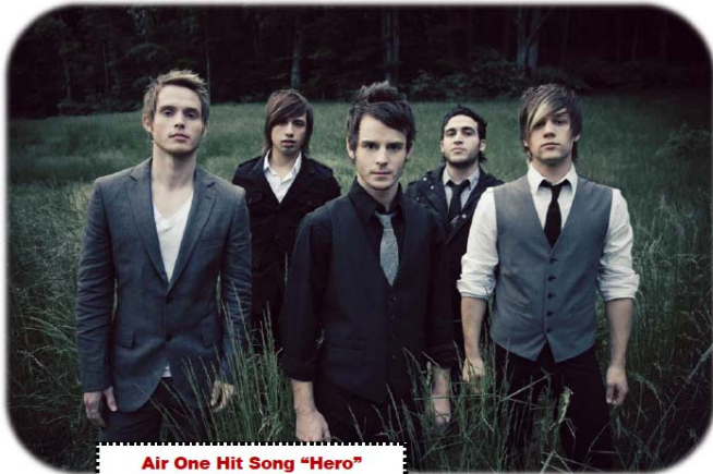
Air One Hit Song "Hero"