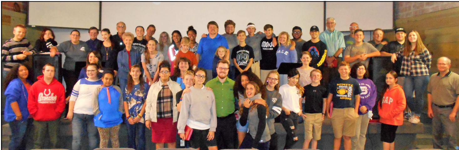
Sanctuary Choir and echo Student Ministry