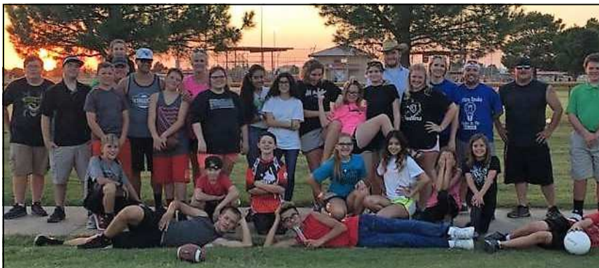
UTPB cookout & games day with Asbury-UMC youth group.