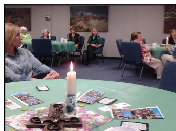
Table decorations created by members set the loving atmosphere for each meeting. The season of Lent was represented by a cross and candles.

Friendship, faithfulness, and quality time with inspiring women are the side benefits of UMW membership.