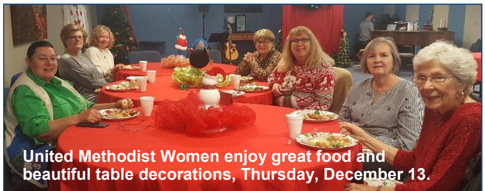
United Methodist Women enjoy great food and beautiful table decorations, Thursday, December 13.

Wednesdays, beginning Feb. 6 | 6:00- 7:30pm Room B5 Books $14