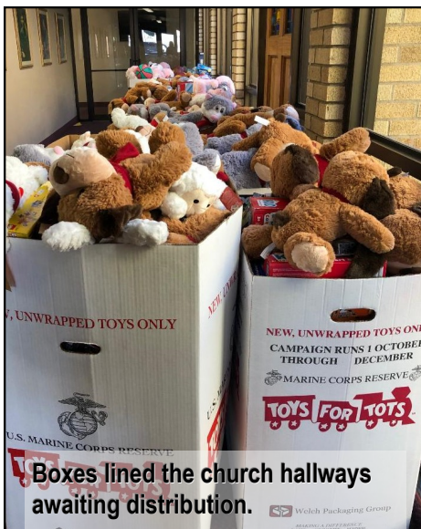
Boxes lined the church hallways awaiting distribution.

Toys For Tots and provide a larger distribution network as we live our mission to make a difference in our church, our community and our world.