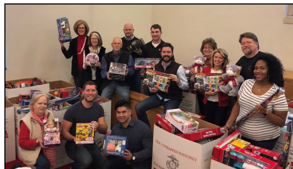
Church Council members display some of the toys.