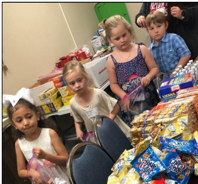
Our Kinder-First grade Sunday School class made "Love Packs" for individuals in need in our community!!!