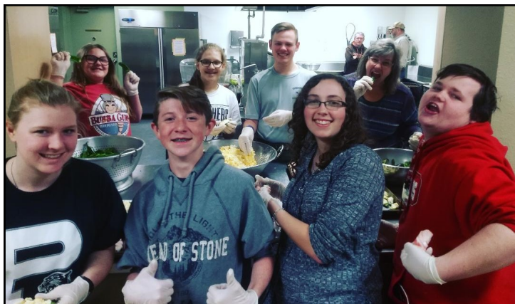
Youth making Jalapeno Poppers for the Wild Game Dinner.