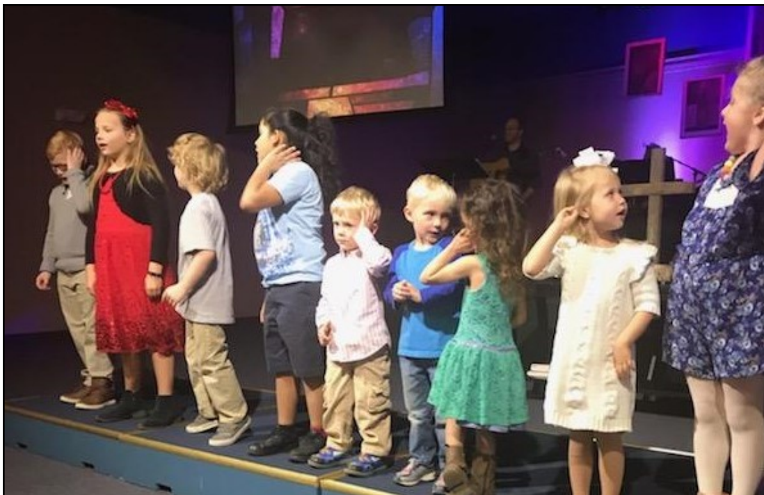
The Fellowship worship service was treated to the Foundation Kids singing, Out of the Mud , on Sunday, February 24. A monthly song presentation is one exciting activity to provide children ways of learning about Jesus.