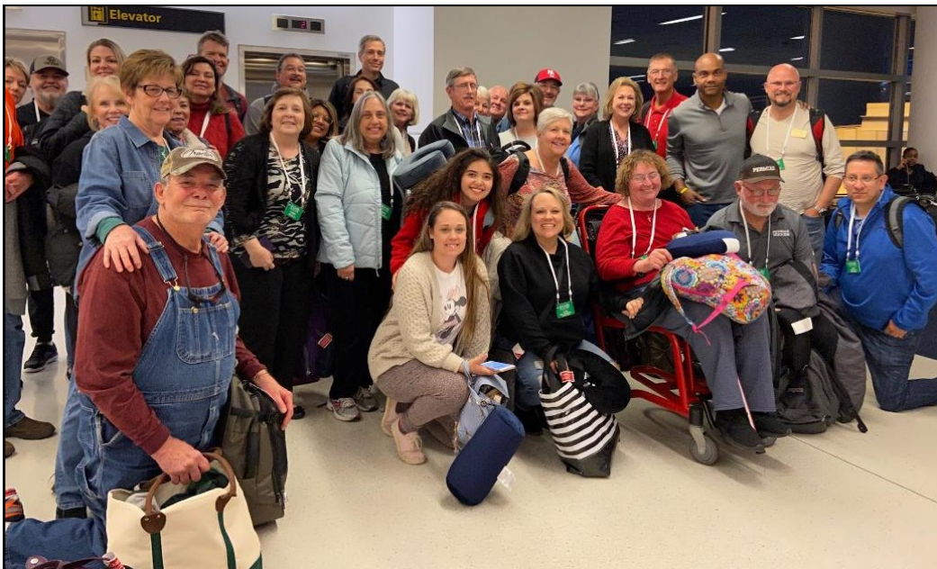
The Israel Pilgrims as they begin their journey to the Holy Land