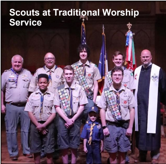
Scouts at Traditional Worship Service